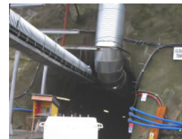
Tunnel Mouth (Tunnel under construction)

A 5m diameter, 8km long tunnel was constructed for a major UK utility. The turbine outflow emerges into Scotland's famous Loch Ness.