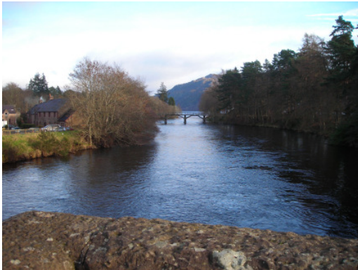
Loch Ness, Scotland

A 5m diameter, 8km long tunnel was constructed for a major UK utility. The turbine outflow emerges into Scotland's famous Loch Ness.